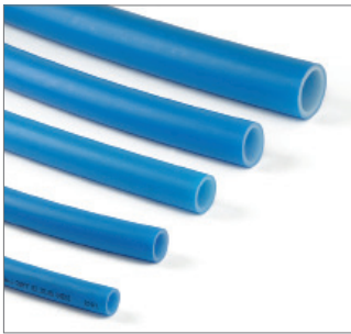
Pipe sizes 3/4 to 2 in.

For service line and underground applications, it is the responsibility of the installer to ensure fittings selected meet local jurisdictional codes.