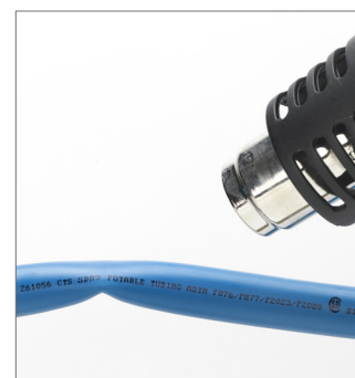
Repair kinks without cutting

All MUNICIPEX pipe is shipped in protective packaging. MUNICIPEX should be stored in the original packaging until time of installation.