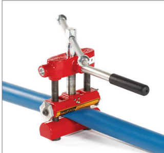
Standard tools and connections