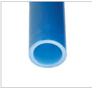
No internal deposits