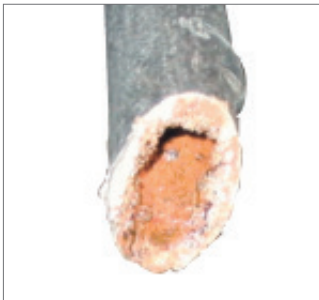
Corrosion build-up in metal pipes