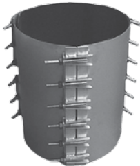
5636 (Style 3)