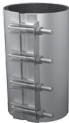
5616 (Style 1)