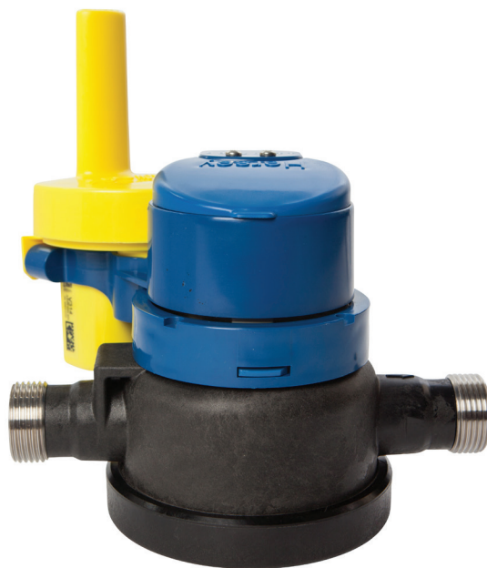
Integral HOT ROD®

HOURLY CONSUMPTION DATA: The HOT ROD modules come standard with the ability to log and store up to 170 days of hourly consumption data that can then be downloaded by a meter reader/technician using the same Street Machine™ Mobile Receiver that is used to read meters. The meter reader would just start up EZ Profiler™ Software and swipe a magnet over the top of the Hot Rod module to begin the process. The monthly, daily or hourly consumption profiling data can then be displayed on a bar graph that can be supplied to the customer to help justify the amount being charged and resolve high water bill disputes/complaints. This information can also be used to monitor and address water conservation initiatives, such as, odd-even watering restrictions.