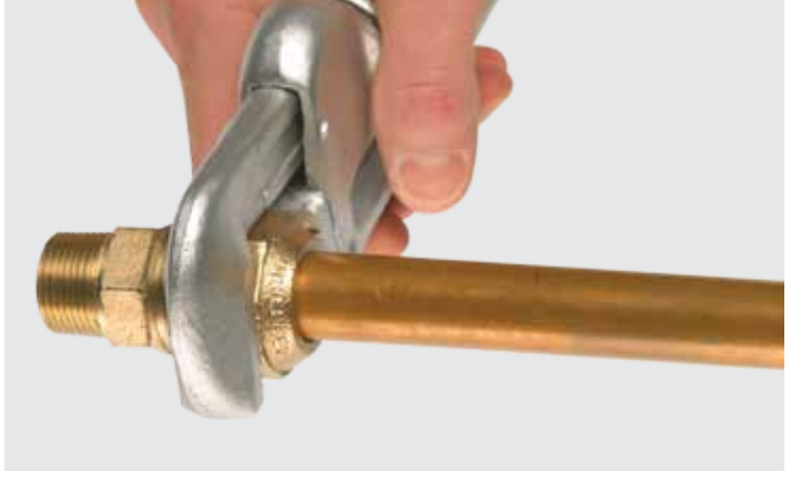
Insert the pipe and bottom out the nut