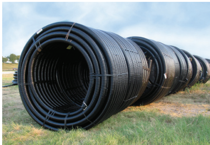
MUNICIPEX PI coils ease installation

MUNICIPEX is rated for continuous use at operating conditions up to 200 psi @ 73.4°F (1,380 kPa @ 23°C) using a 0.63 design factor.*